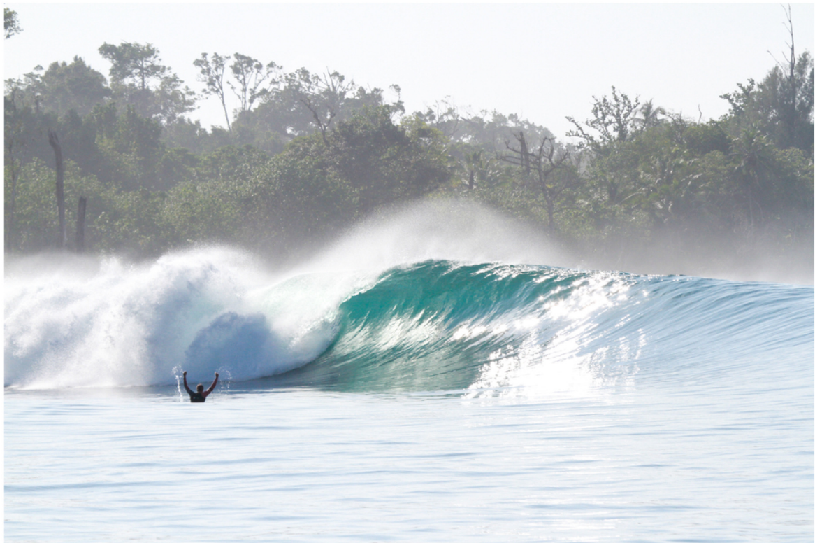
Empty Greenbush Perfection, February.