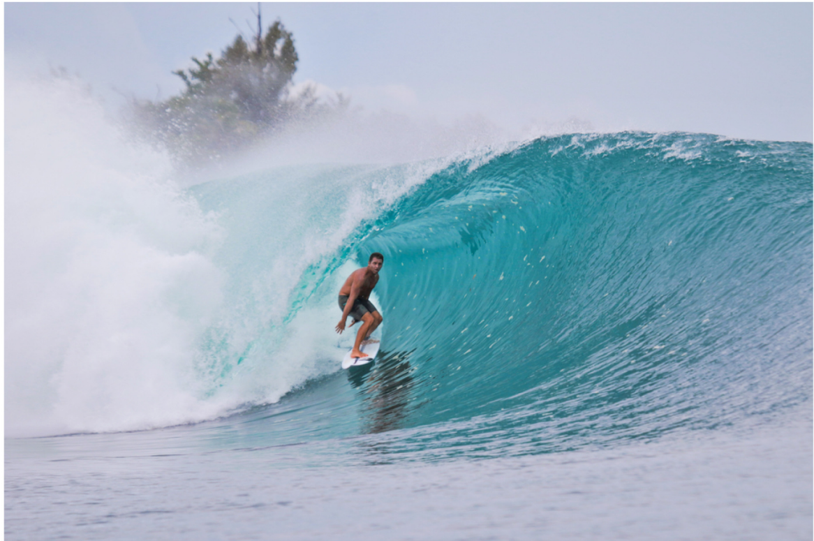
This is Greenbush in January.

Each of these breaks work best in south swells, similarly to the reefs on the east coast of Bali, which work best summer months with a NW wind. While south winds are more common between July and October, it is the opposite from November through to June, when north wind or no wind is common in the Mentawais. Combined with south swells, this can create the perfect mix of perfection at Greenbush and Macaronis, and some others.