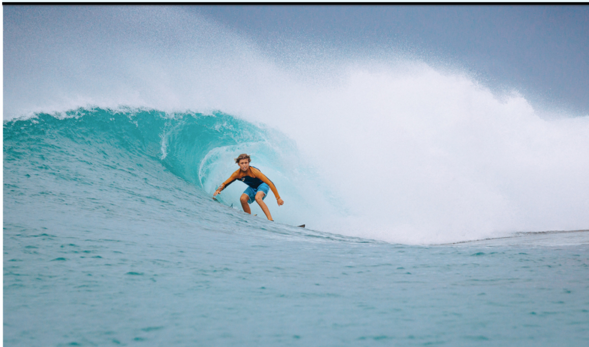
Macas Right, shot in January.