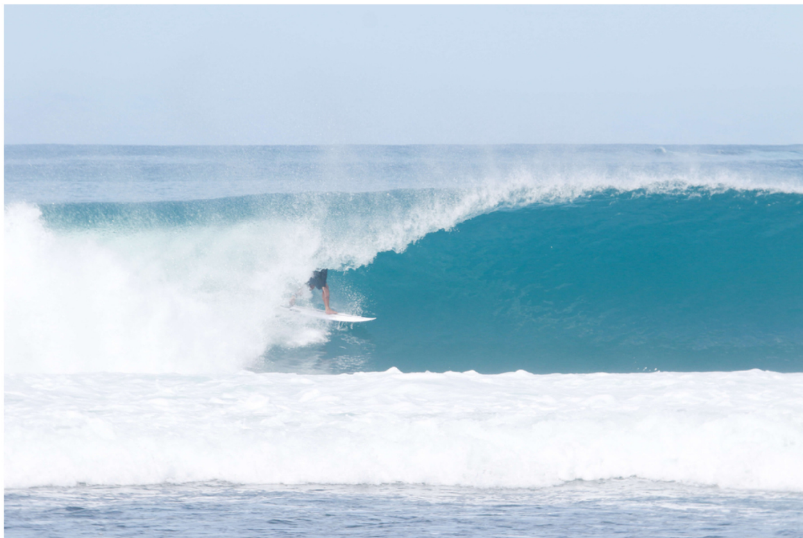
Macaronis In February.