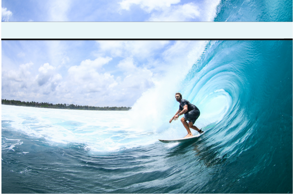
Macas, Surf Coaching Clinics 2018.

If you want to experience the worlds' best waves with only a handful of surfers in the water, then visit Macaronis Resort in the Southern Mentawai Islands from November through to March. Do things differently this year and trade onshore and cold conditions at home, for warm and perfect uncrowded sessions.